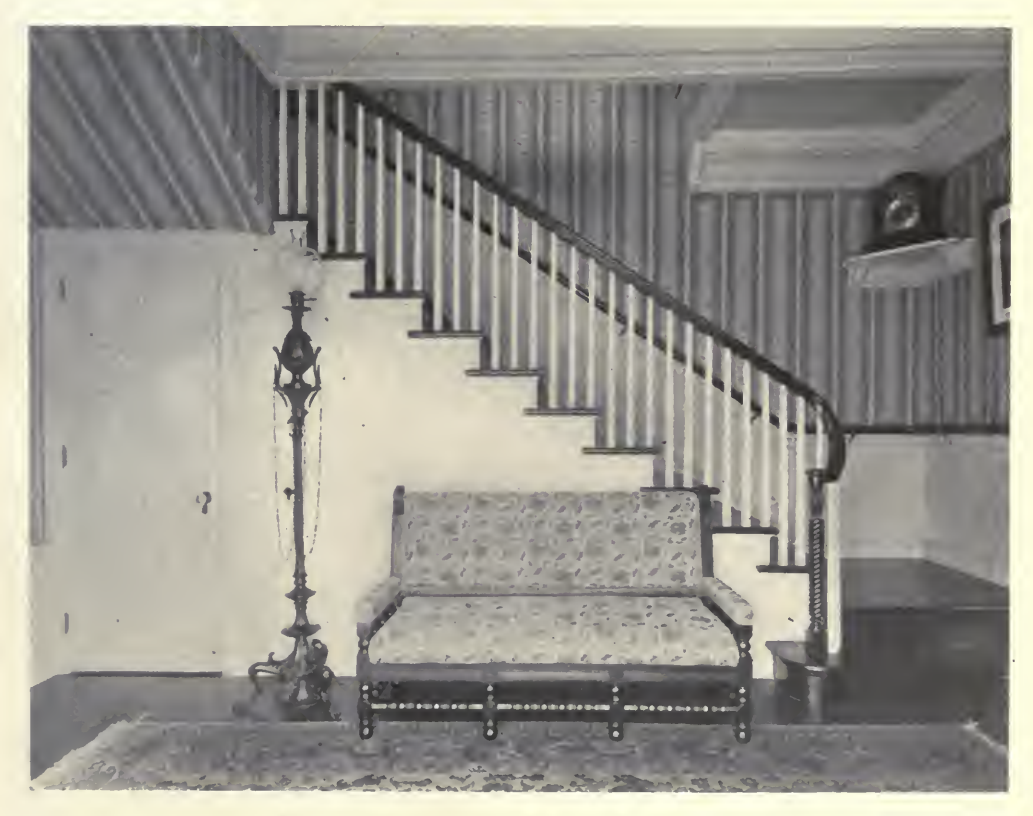
FIG. 17. STAIR HALL IN THE McCALL HOUSE.

there is a foreign accent, it is one of charm; if there are suggestions of the styles of other days, they are only reminiscent. It is not the purpose of the writer to attempt any classification of the designs presented in this article based upon the above. In the present state of American domestic architecture this would indeed be a difficult and invidious task. But in any examination and com-