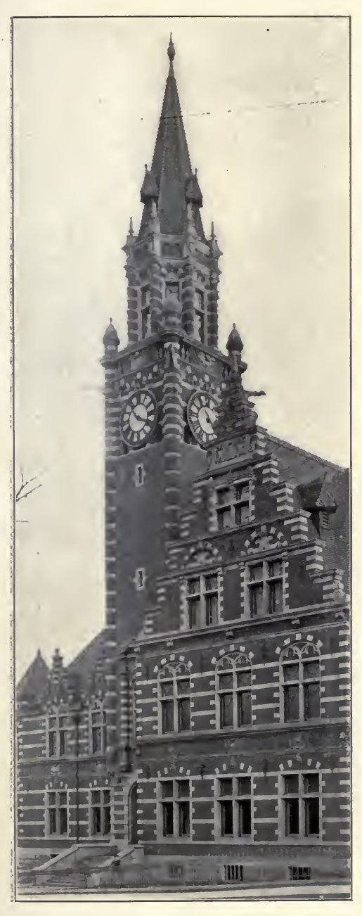
FIG. 3. THE TOWER OF THE POST OFFICE. Paterson, N. J.

of Paterson was erected. The prototype, the old meat market of Haarlem, will of course be recognized by everybody. It has been the motive on which many American architects have executed varia-