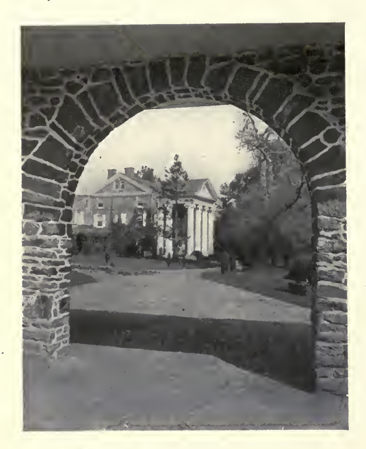
FIG. 24. THE HOUSE AT BRANDYWINE MEADOW FARM. Chas. Barton Keen, Architect.

with a deep and wide round joint. With bricks also are fashioned terrace, window-cap and quoin. The shingles of the roof are gray, and the blinds are white and green in the two stories. Another column by the wall pilaster of the porch would look better, even if it would also certainly be a nuisance and in the way.