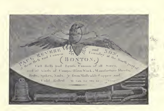
THE SIGN OF PAUL REVERE.