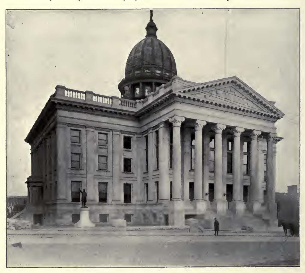
FIG. 1. THE COURT HOUSE.

But who shall blame the people of Paterson? Certainly not their architec-