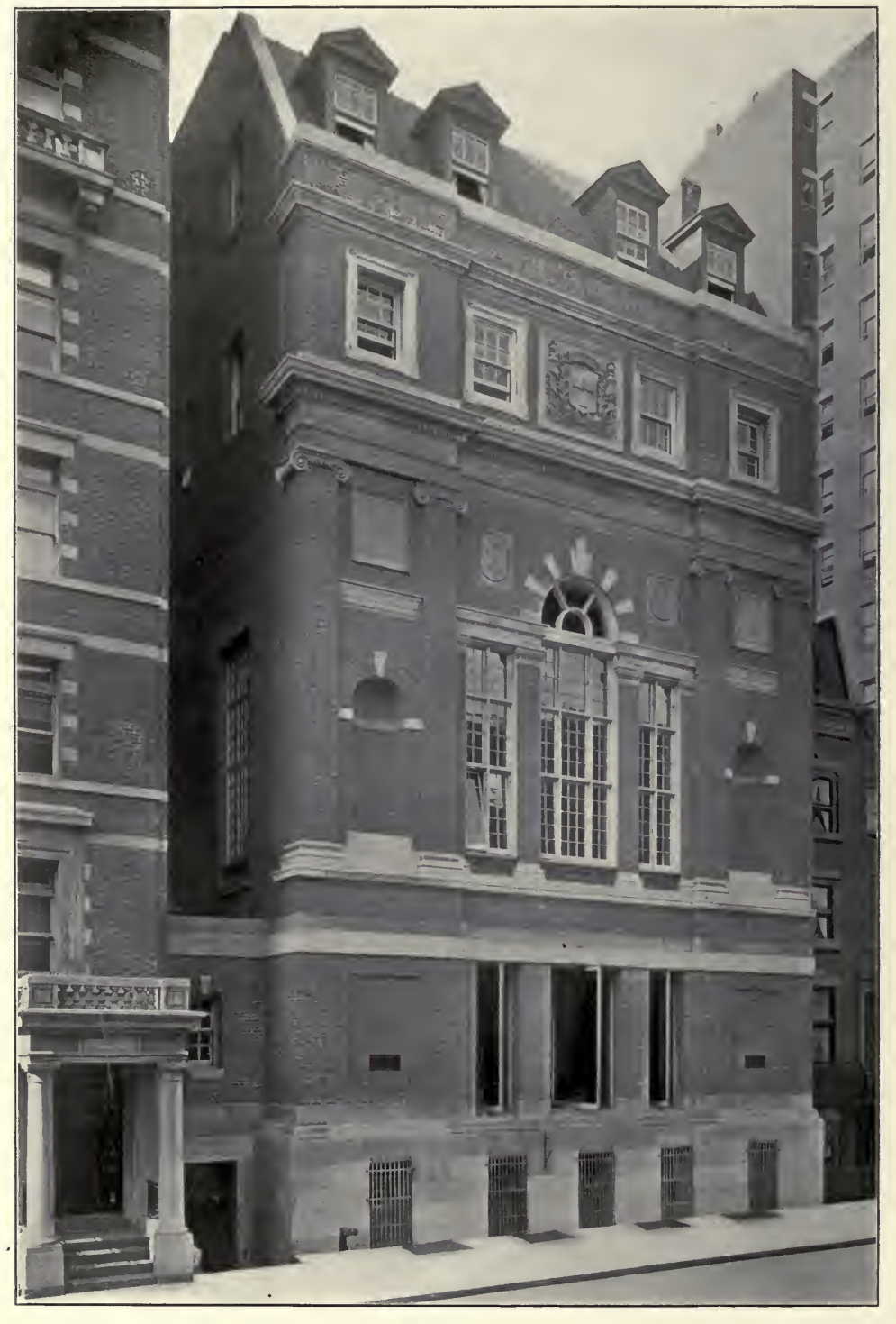
FIG. 4. THE NEW FACADE OF THE HARVARD CLUBHOUSE. Between 44th and 45th Streets, New York City. McKim, Mead & White, Architects.