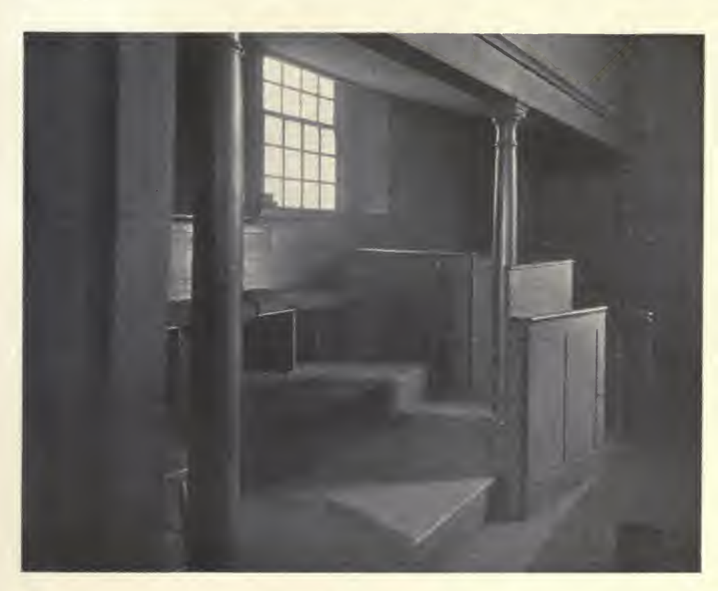
FIG. 6. NORTH CHURCH-DETAILS OF THE INTERIOR.

At the back of the altar there is a conception of the Lord, breaking bread, by Penniman. It lacks in manipulation, but in thought it is a masterpiece. It repays a visit to the church—that face