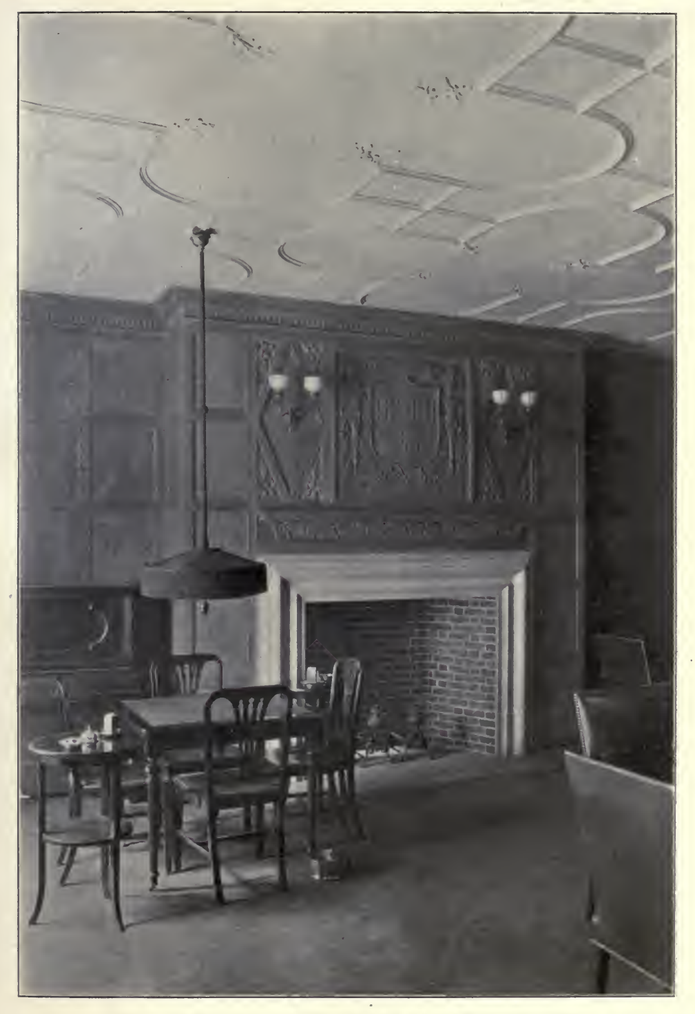
FIG. 3. THE CARD ROOM IN THE NEW HARVARD CLUBHOUSE. Between 44th and 45th Streets, New York City. McKim, Mead & White, Architects.