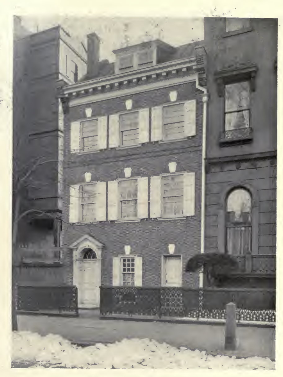
FIG. 30. NO. S10 PINE STREET.