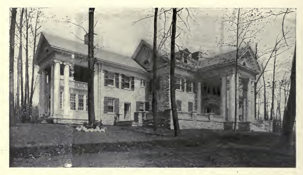
FIG. 31. RESIDENCE NEAR ST. DAVIDS.