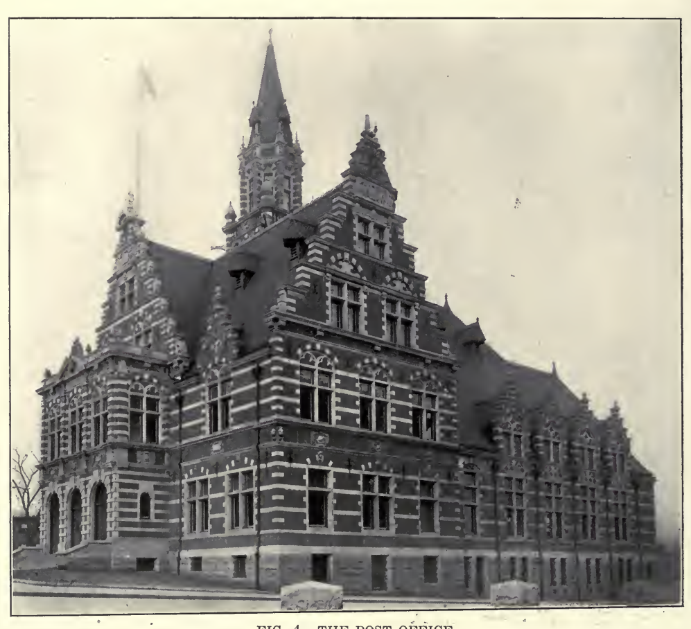
FIG. 4. THE POST OFFICE.