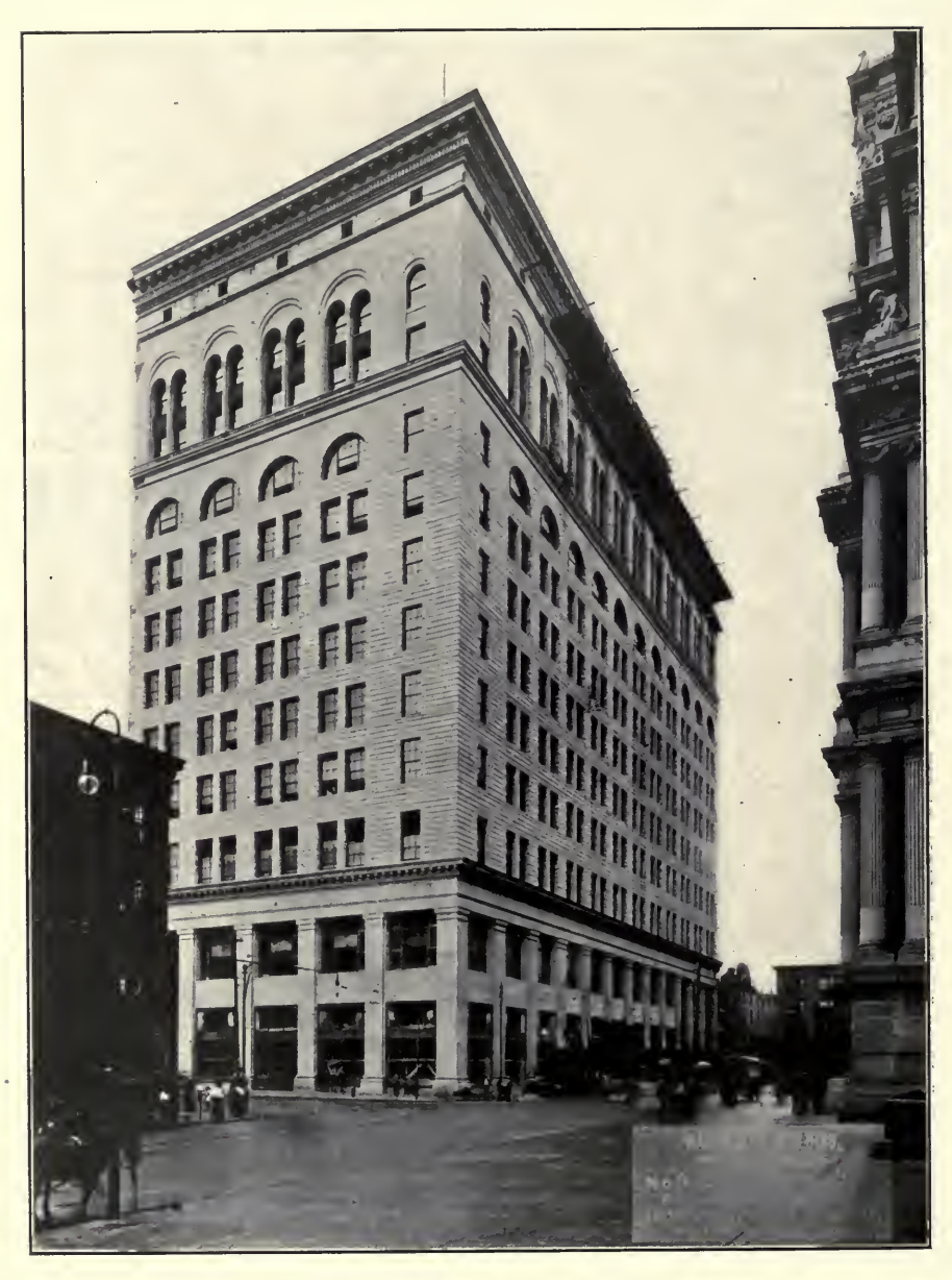
THE NEW WANAMAKER BUILDING.