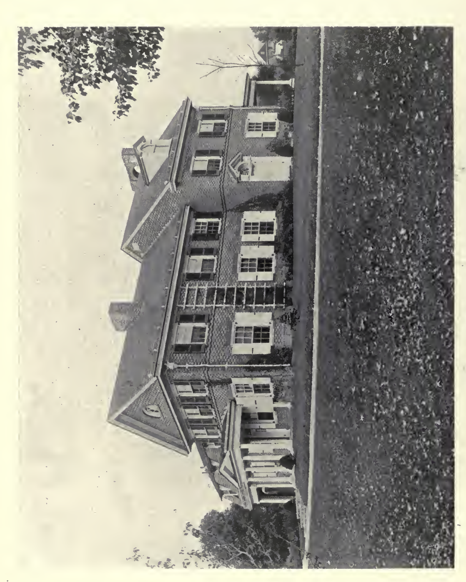
FIG. 16. THE PATTON HOUSE.