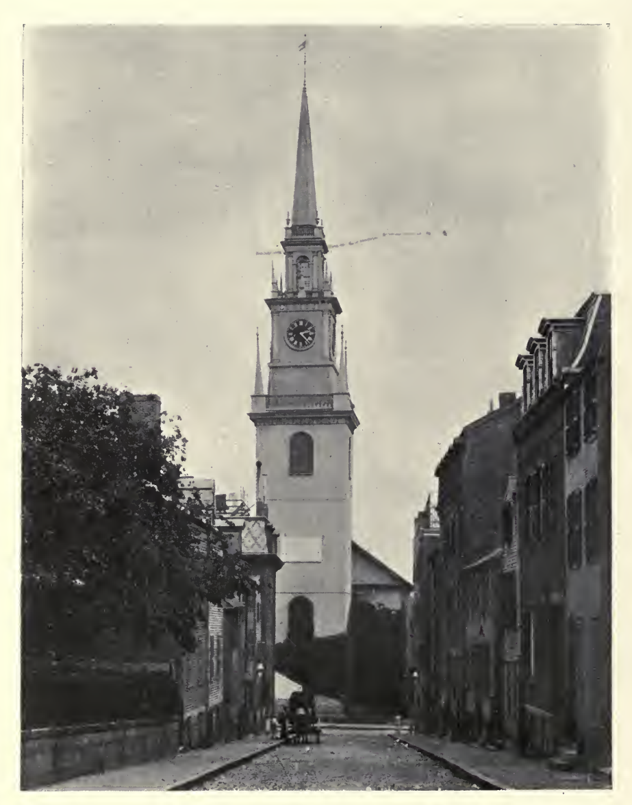
FIG. 1. NORTH CHURCH AS IT IS.