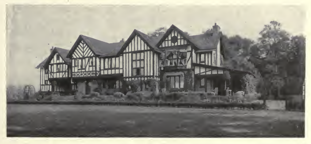
FIG. 32. THE RESIDENCE OF MR. A. P. BAUGH.

Another recent example of Mr. Boyd's work in suburban architecture is given in Figure 31. The house stands back some distance from the public road, and is beautifully situated on a wooded plateau, with gently sloping lawns around, which are unbroken by any roadway in front, the drives winding and curving to the side and rear entrances. The exterior walls of the building are constructed of stone of a color like the white of pine, and of a texture which is rough, and laid with white beveled joints. The motive of the two-storied portico is repeated at one end of the design, and in the latter are placed the conservatory on the first floor, and over it a balcony on the second floor. The main façade faces the