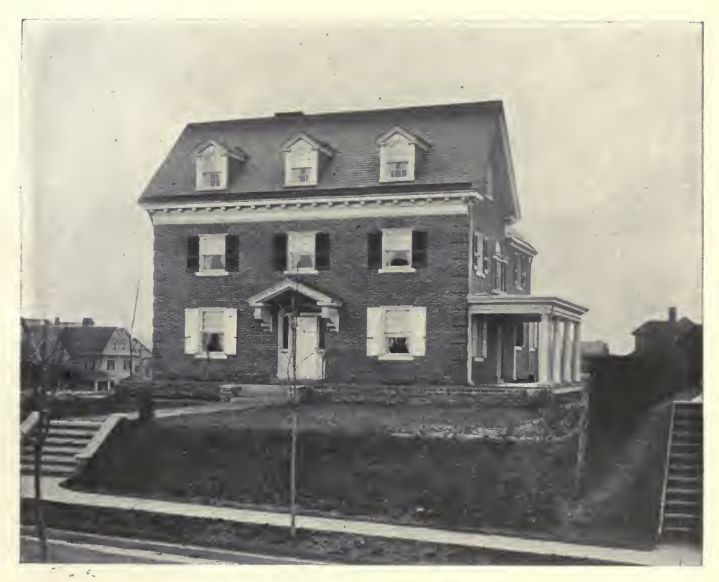
FIG. 23. HOUSE OF MR. G. ELWOOD WAGNER.

chimney in relation to the wall surface below and the treatment there employed, is unfortunate. But this whole treatment of the rough-cast on brick, with its grayish white color, and with the dark red bricks used in occasional wall surface and trimming and chimney, is one of great interest and fascination; and those who know the work of the English architects, for example, that of C. F. W.