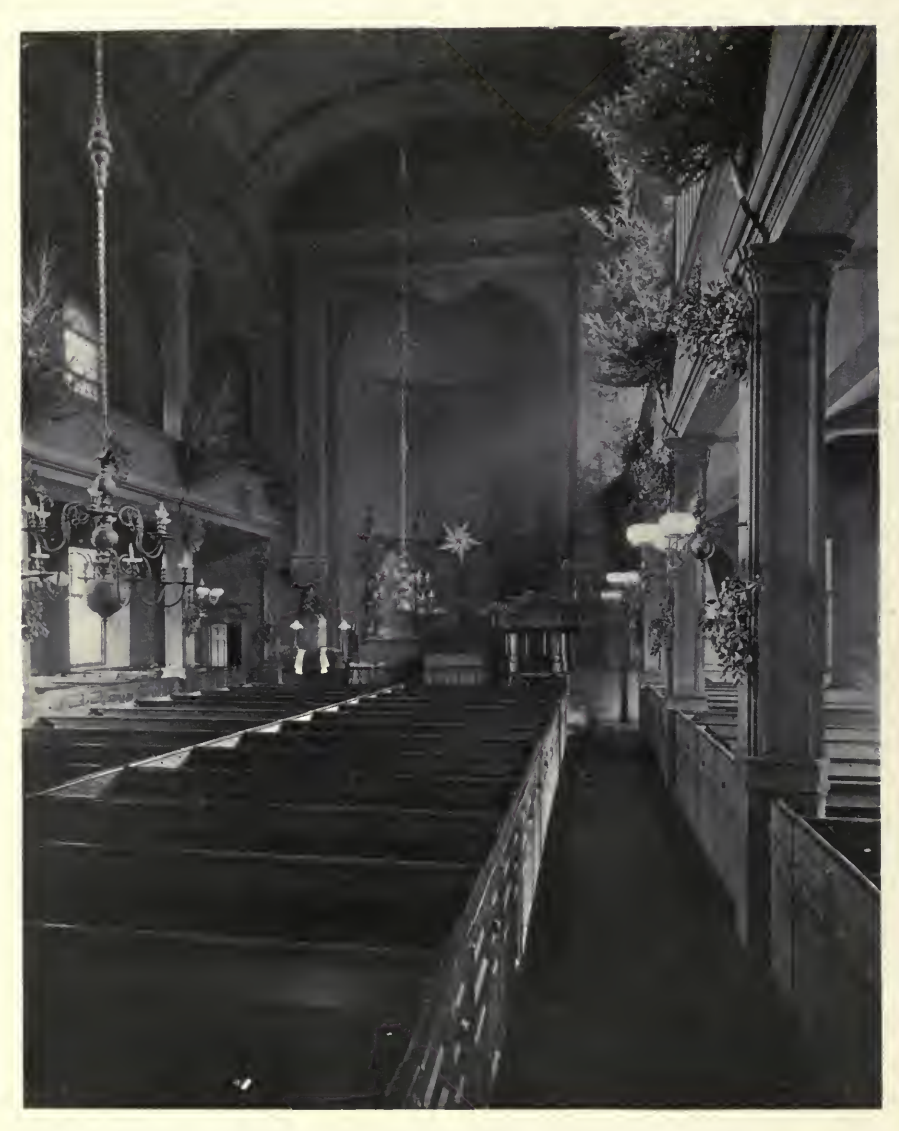
\mbox{FIG. 2. GENERAL VIEW OF THE INTERIOR OF NORTH CHURCH.} \\ \mbox{Boston, Mass.}