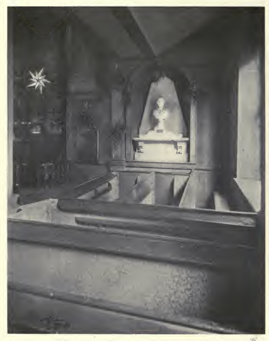
FIG. 5. NORTH CHURCH—DETAILS OF THE INTERIOR.