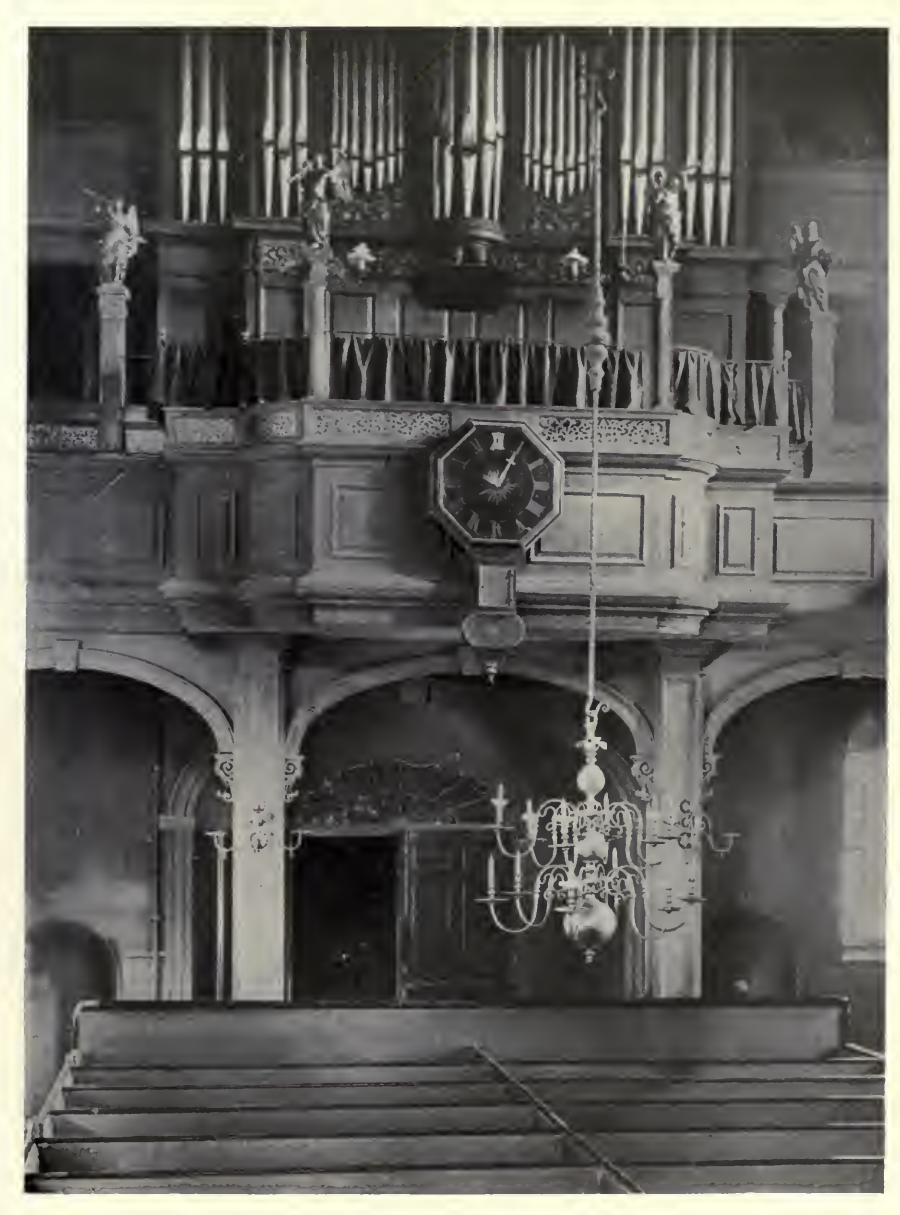
FIG. 4. THE NORTH CRURCH—DETAILS OF THE INTERIOR.