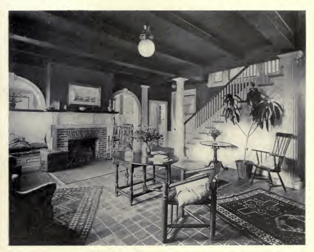
FIG. 15. HALL IN THE PATTON HOUSE.

mottled brickwork of the first story is carried up to the eaves in the kitchen wing, and to the chimney-pots in three of the chimneys; while the gray-white pebble-dash runs down to the water-table in one part of the rear façade, and to the top of the front chimney. The exterior, like all those with the change in direction of horizontal axes, suggests an interesting plan. The general effect of the composition, at least of the front façade, is