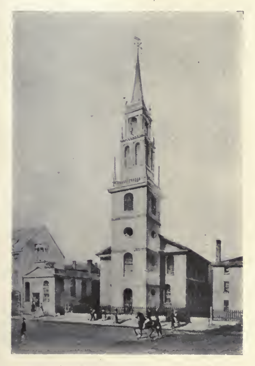
FIG. 3. NORTH CHURCH AT IS WAS.

The Sunday-school room, which we enter from the alley, is narrow and long, for it was only patched on, with what room was left, across the back of the church. But there was convened the second—quite probably the first—Sun-