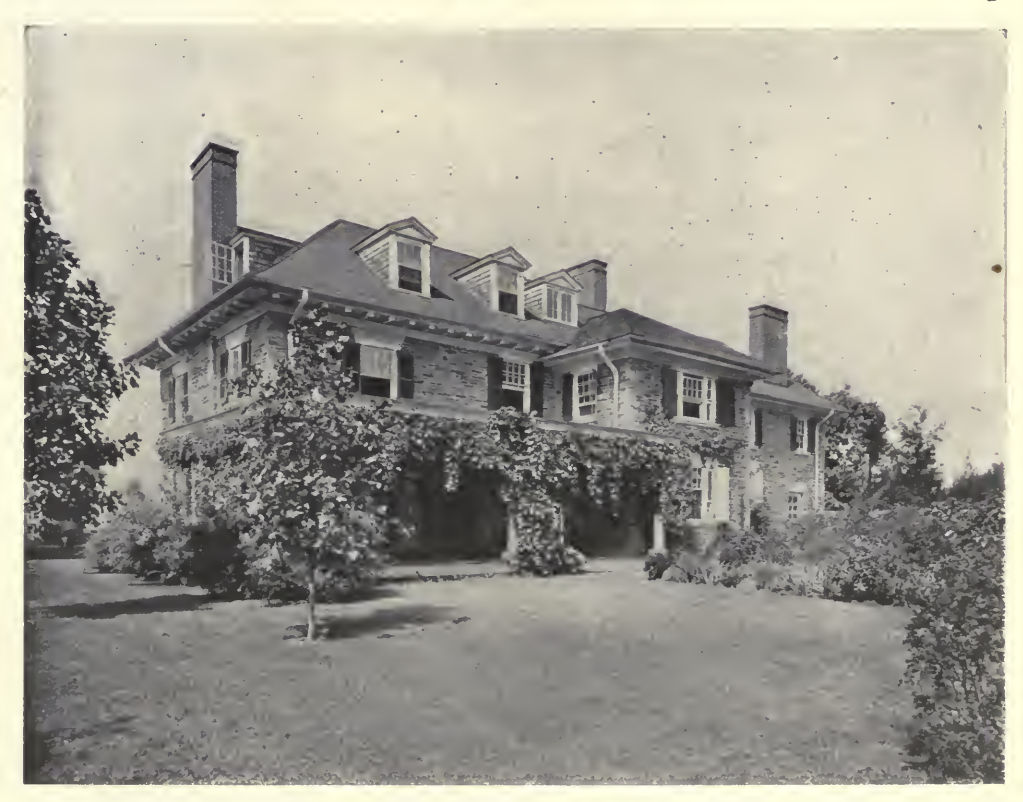
FIG. 2. HOUSE OF MRS. WALTER COPE.

square miles of square corners, with the absence of diagonal avenues and the lack of opportunities or possibilities of picturesque vistas; with the want of curving roads and of hills of any kind, sug-