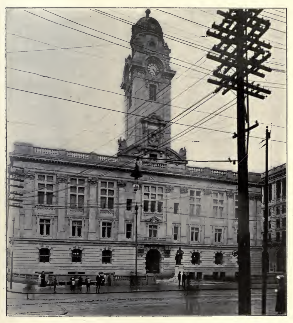
FIG. 2. THE CITY HALL.