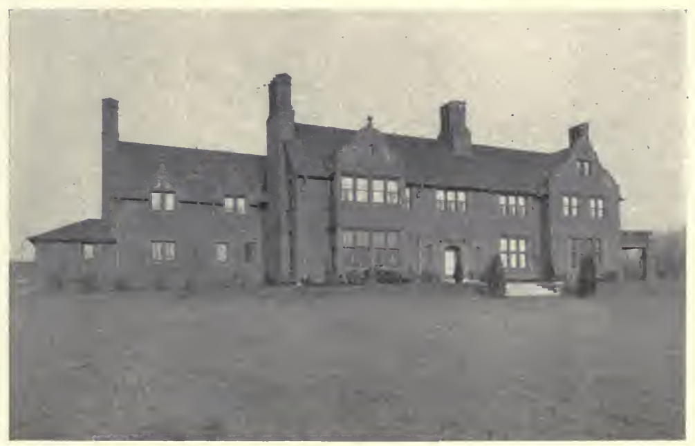
FIGS. 5 AND 6. HOUSE OF J. WILMER BIDDLE. Cope & Stewardson, Architects.