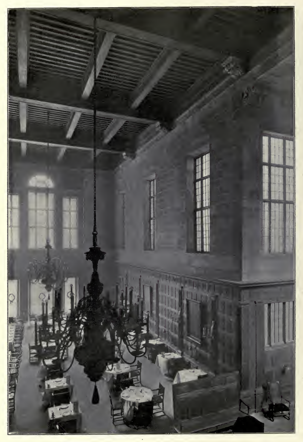
FIG. 2. THE NEW DINING HALL OF THE HARVARD CLUB. Between 44th and 45th Streets, New York City. McKim, Mead & White, Architects.