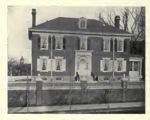
FIG. 19. THE McCALL HOUSE. Germantown, Pa.

By the same architect is the McCall House in Germantown. The requirements of the client in this particular case, and particularly impressed upon the architect, were restfulness and quietude. To meet these, in the planning and constructional details, brick partitions and deadened floors were adopted, and the interior arrangements were so ordered that all noise-producing agencies of the household were set away from the family