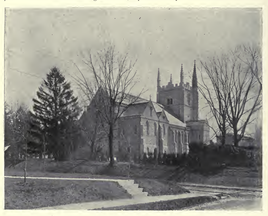
FIG. 36. CHAPEL AT SHARRON HILL.

Figure 35 shows really a stable and dovecote combined, about half of it being given up to the pigeon loft. The success in the solution of a "small" architectural problem may be as marked as in the