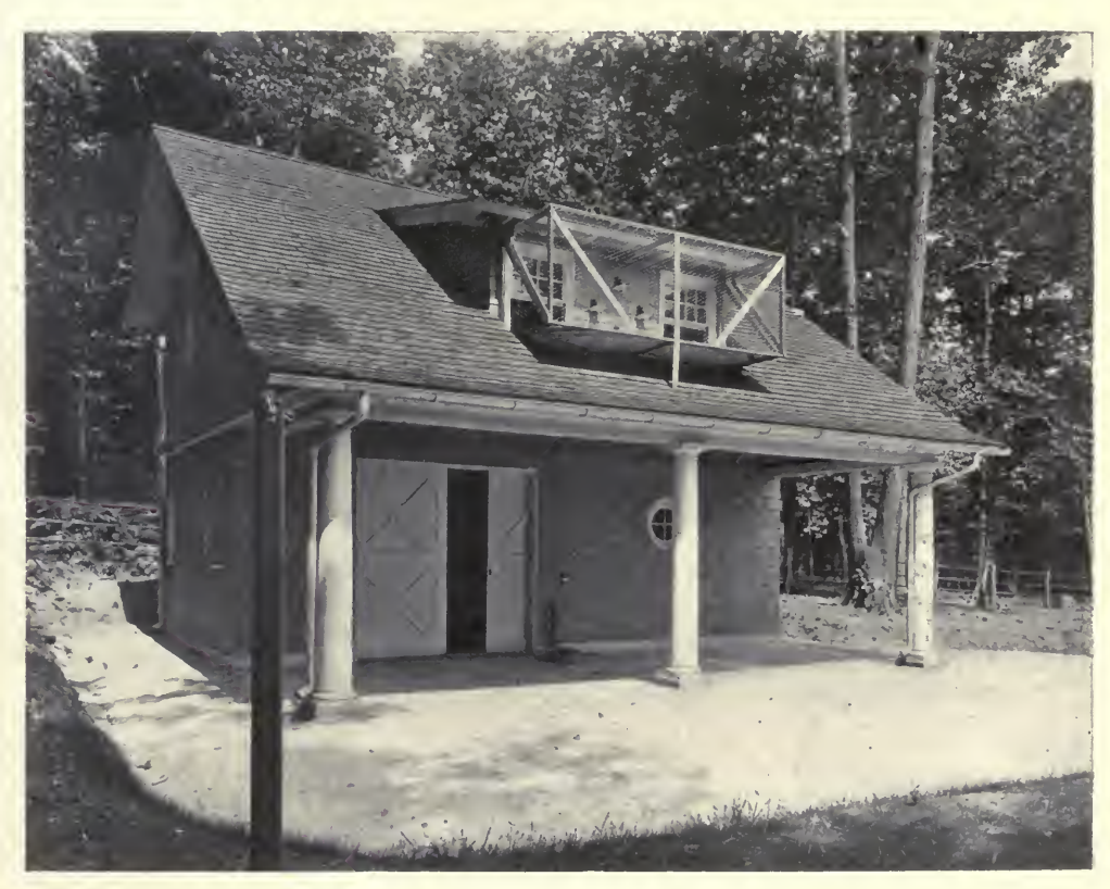
FIG. 35. STABLE AT GLENSIDE, PA. Lawrence Visscher Boyd, Architect.

flections of whatever kind of light happens to fall upon it. It is like the difference between the velvets and the silks. The architect has built up his half-timber work in this example, with heavy timbers constructed solidly on double interlined sheathing, and has left it rough on the faces, planing it only here and there by hand for a surface play of light and shade; and this treatment is repeated in